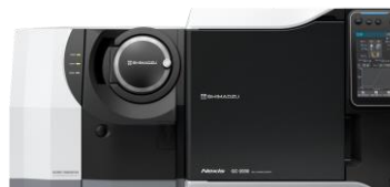
Fig.2 Shimadzu GCMS-TQ™8040 NX