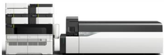
Fig. 1 Shimadzu LCMS™-8045