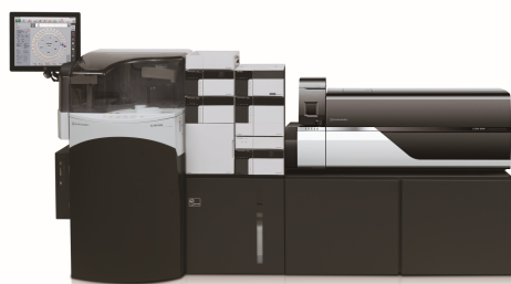
Fig. 1 Fully Automated Sample Preparation LC/MS/MS System (CLAM™+LC/MS/MS)