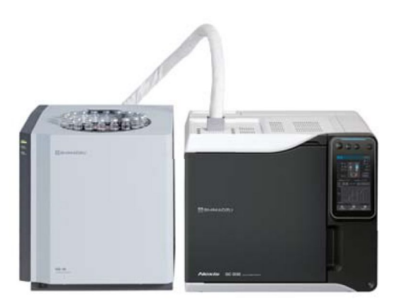
Fig. 1 Nexis GC-2030 and HS-10