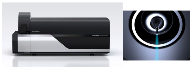
Fig. 1 LCMS-8060RX and CoreSpray

This report presents an example of quantitative analysis of free fatty acids in human plasma and serum using the highly stable LCMS-8060RX system coupled with a delay column.