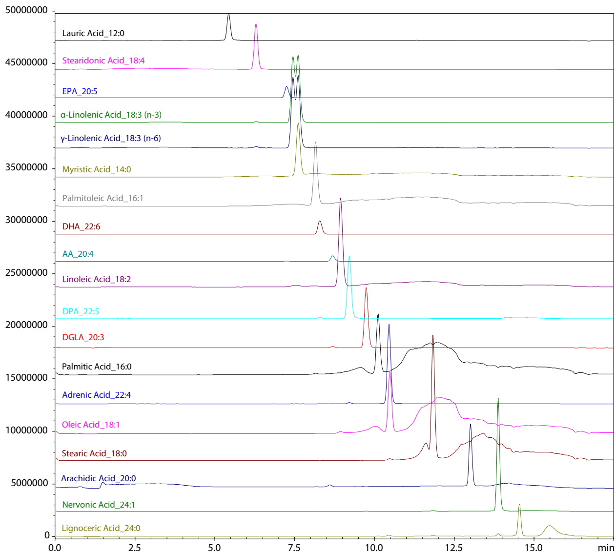
Fig. 3 The MRM chromatogram of 19 free fatty acids